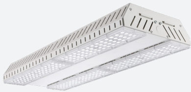
GUARDIAN PRO FLOODLIGHT